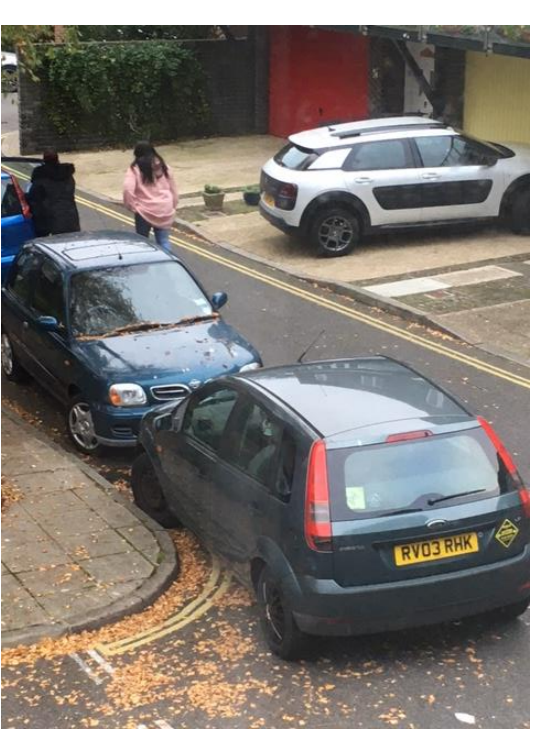
Poynings Close, 2020