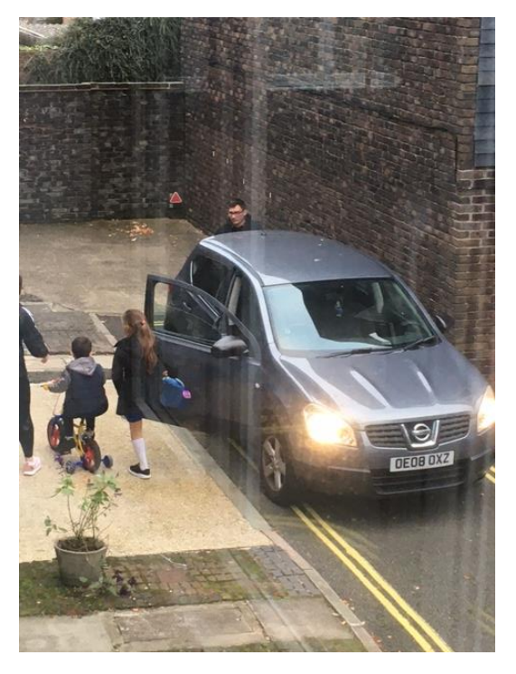
Poynings Close, 2020