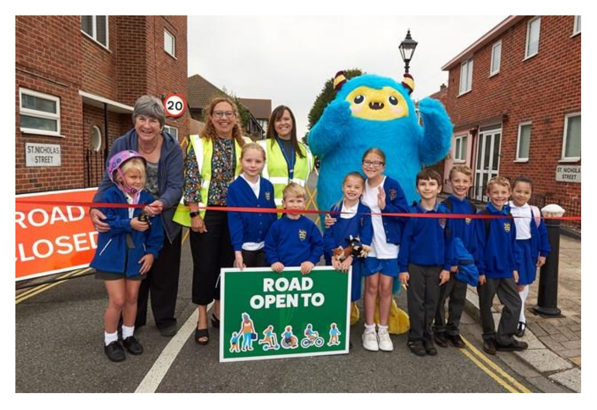
St Jude's Launch Day © About My Area, September 2021