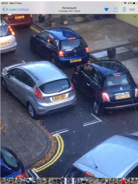
Poynings Close, 2017